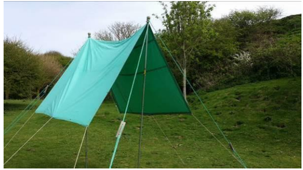
Fire Shelter 3