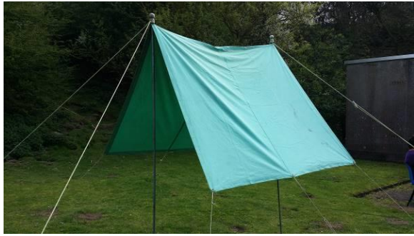
Fire Shelter 1