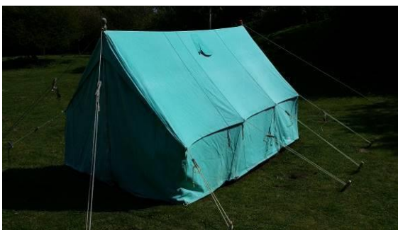
Robinson (9'6 x 6'4)