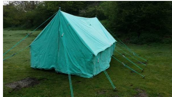
Lions (12' x 8')