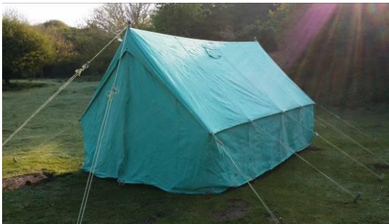
Inner Wheel (12' x 6'6)