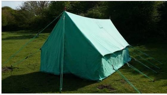
TVS (13' x 8')