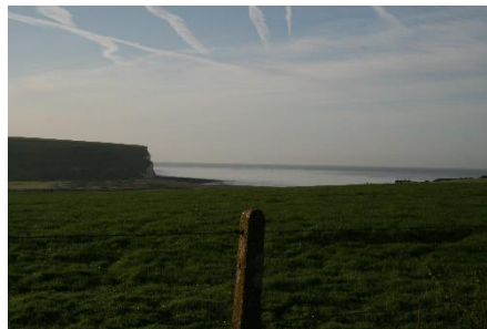
View from the top of the steps in Sealarks looking out to sea.

The site started life as a sand pit and was then taken over by the General Post Office. The GPO built a telephone repeater station to act as a terminal point for cross channel cables going out to Rouen and Paris. Seahaven Division bought the site which was officially opened as Sealarks Campsite on 7 th June 1987.