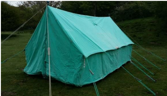
Jubilee (13' x 8')