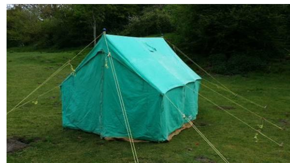
1 S/L (9'6 x 6'4)