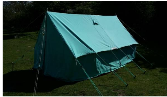
Opportunities (13' x 8')